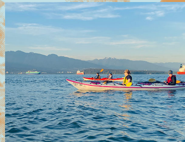
JERICHO EXPLORER AND SUNSET TOUR